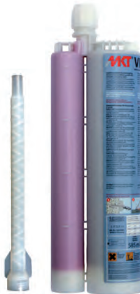
Cartridge VME 585 ml Side-by-side cartridge + Mixer MCVME0585