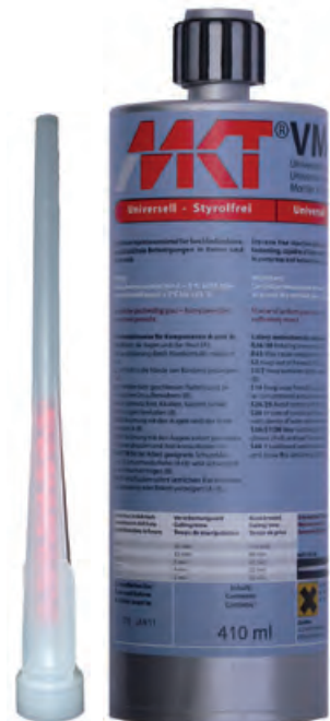
Cartridge VMZ 410ml