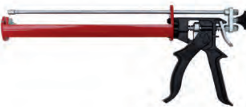
Dispenser VM-P Standard Refer Page 48