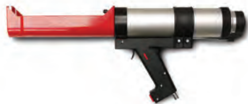
Pneumatic Dispenser Refer Page 48