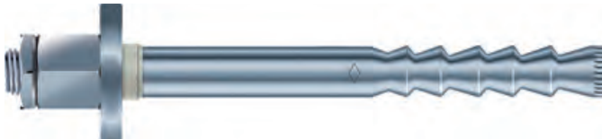
Threaded Stud VMZ-A dynamic Refer Page 45