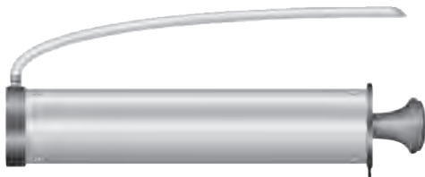
Blow-Out Pump VM-AP Refer Page 49