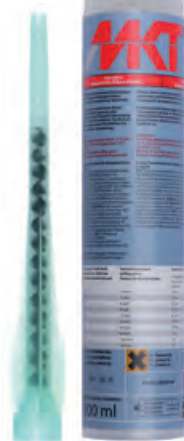
Cartridge VMU 300ml