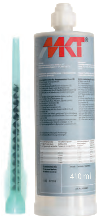
Cartridge VM-PY 410ml