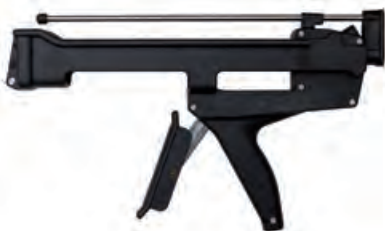
Dispenser VM-P 385 Profi Refer Page 48