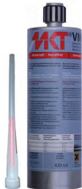
Cartridge VMK 420ml