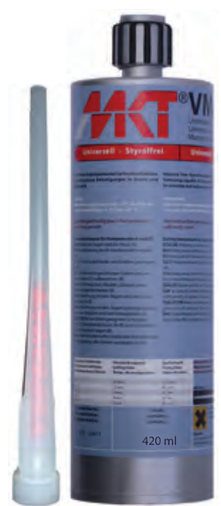
Cartridge VMU 420ml