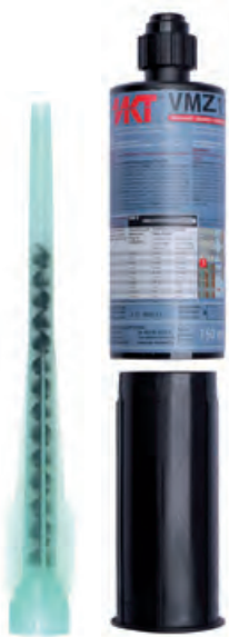
Cartridge VMZ 150ml