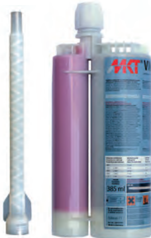
Cartridge VME 385 ml Side-by-side cartridge + Mixer MCVME0385