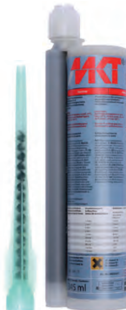
Cartridge VMK 345ml