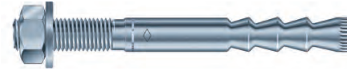
Threaded Stud Anchor VMZ-A Flat End Refer Page 44