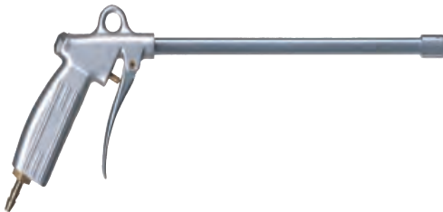
Air Gun VM-ABP Available on request