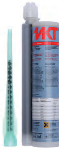
Cartridge VMU 345ml