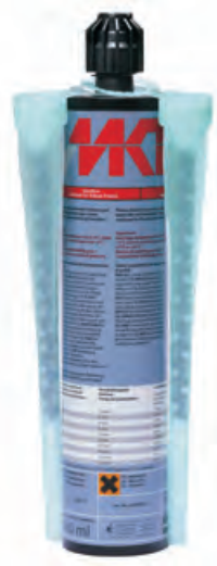
Cartridge VMU 280ml