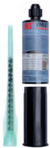
Cartridge VMU 150ml