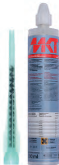
Cartridge VMK 300ml