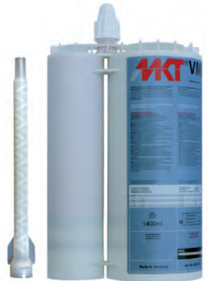
Cartridge VME 1400 ml Side-by-side cartridge + Mixer MCVME1400